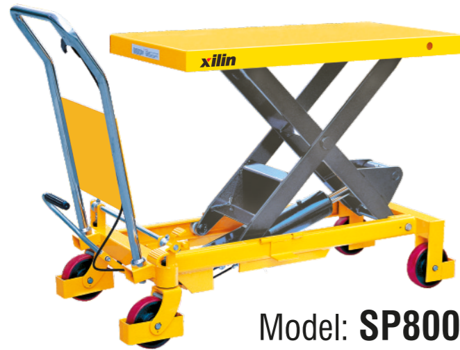
Model: SP800 SP1000 SP1500

Conforms to EN 1570-1 Based on Directive 2006/42/EC