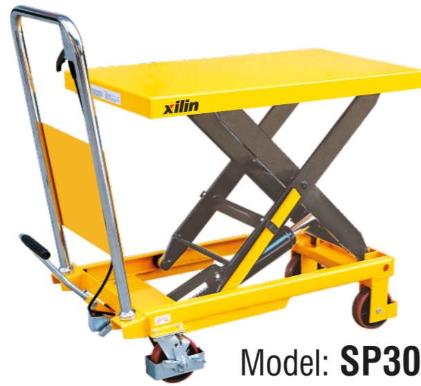
Model: SP300 SP500