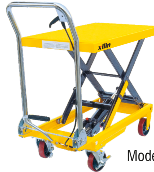
Model: SP150 SP300 SP500