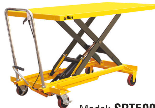
Model: SPT500 • Lower controlled by hand