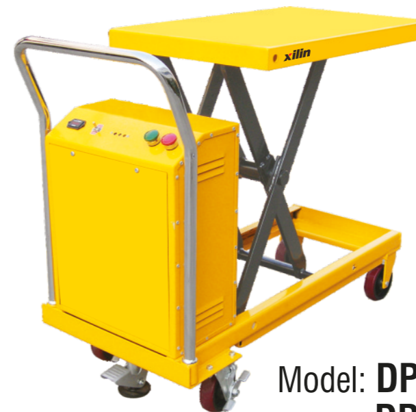
Model: DP30 DP50