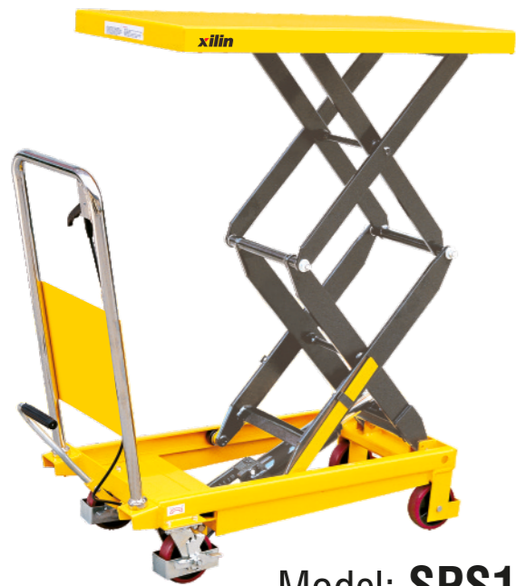
Model: SPS150 SPS350